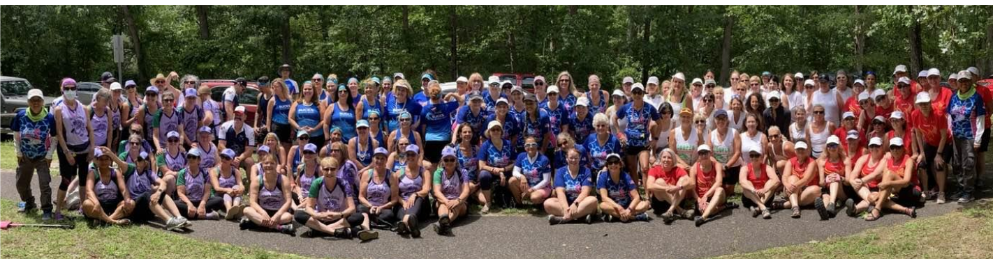
At Gilda's South Jersey