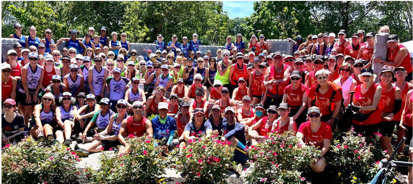
At Cooper River DBF